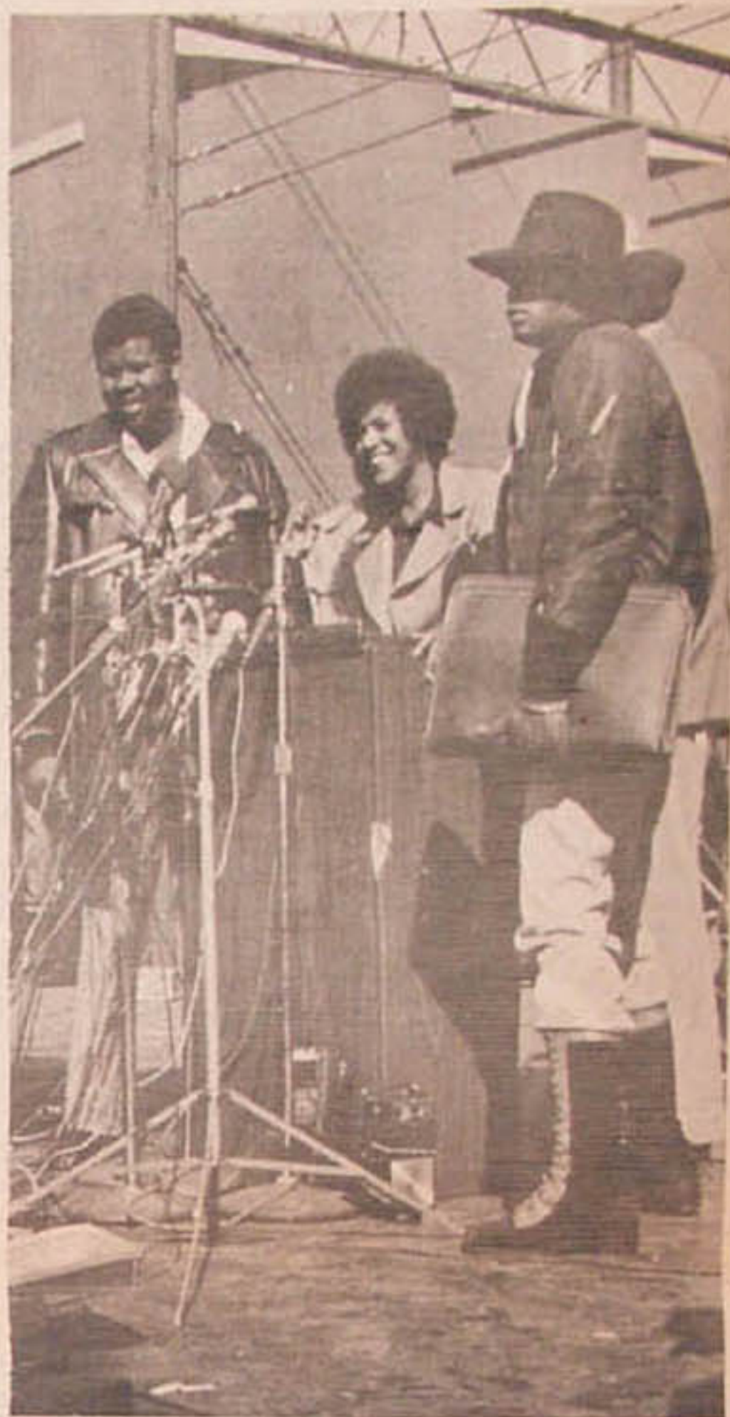
"We're talking about liberating the United States of America."