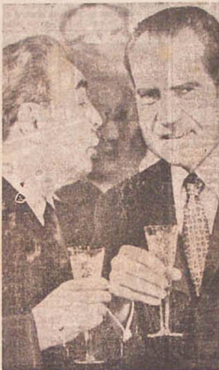
BREZHNEV AND NIXON

Under the guise of cutting down missile stockpiles, these two great powers veritably divided up the world,