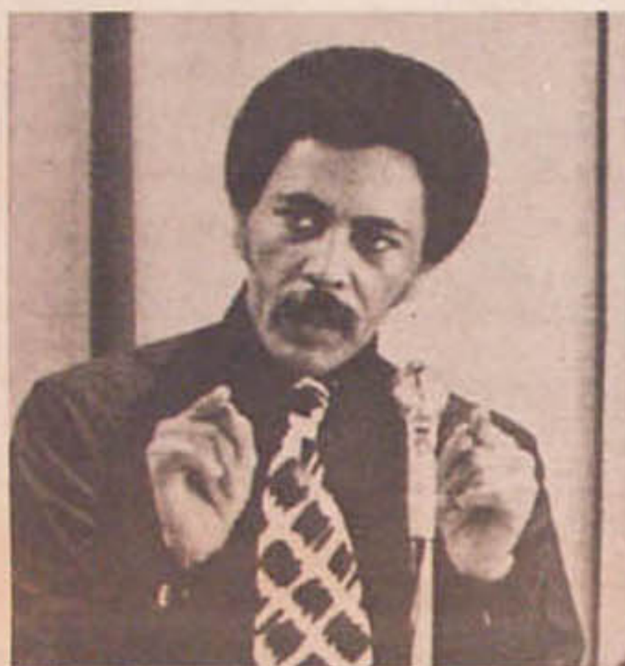
RE-ELECT CONGRESSMAN RON DELLUMS.