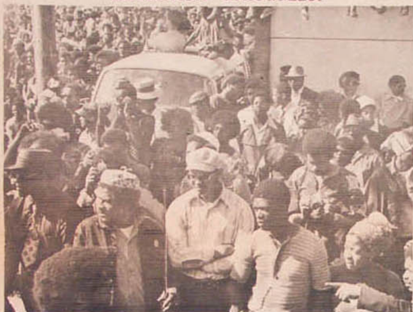
"The people of the Black and the third world MUST unite against the common enemy, because the common enemy is definitely uniting against us."

OVER 25,000 U.S. BLACKS DEMONSTRATE SUPPORT OF MOTHERLAND LIBERATION STRUGGLES.