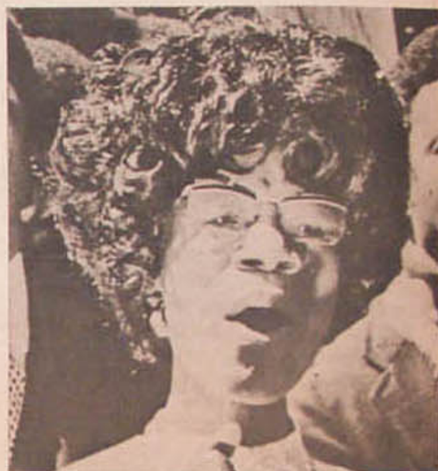
CONGRESSWOMAN SHIRLEY CHISHOLM FOR PRESIDENT.

SHIRLEY CHISHOLM FOR PRESIDENT OF THE UNITED STATES